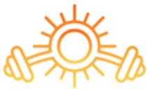
MINDFUL BODY FITNESS & MASSAGE Mindful Body Fitness & Massage