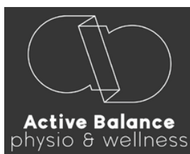
Active Balance Physio