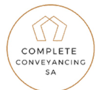
Complete Conveyancing SA