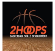
2 Hoops Basketball